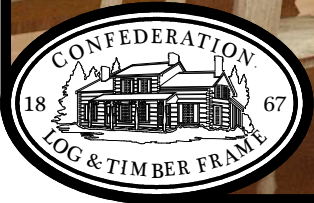
AUTUMN RIDGE II - 2170 sq.ft